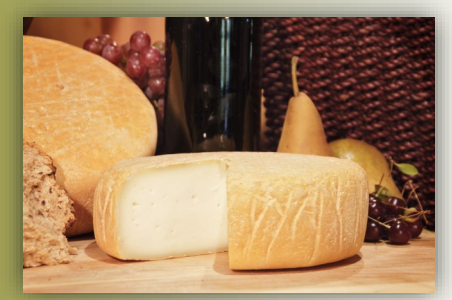
CABRA LA MANCHA