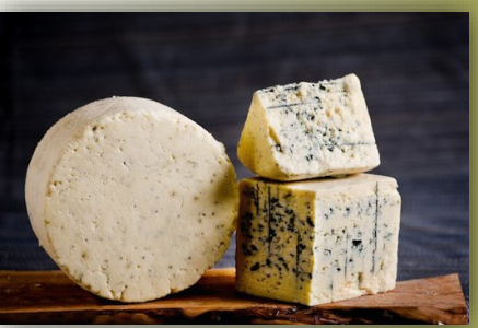
BIG WOODS BLUE