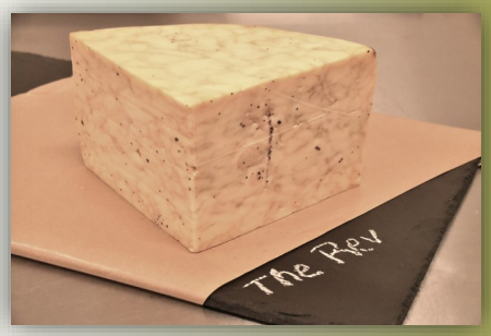
"THE REV" RESERVE